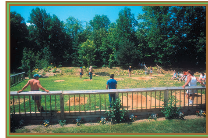
Regulation Horseshoe & Quoit Pits