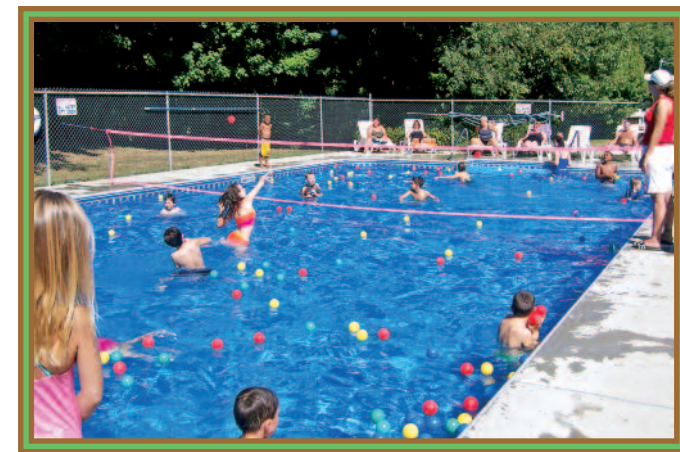
25x51' Swimming Pool

Why settle for less by searching for more? Enjoy the Oak Haven experience ... truly what camping was intended to be!